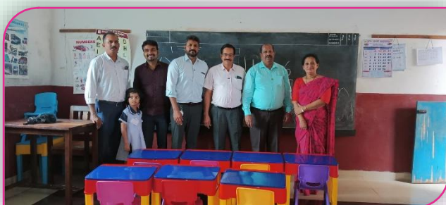
Desks worth of Rs 43000/= donated to Ashok Vidyalaya Ashoknagar Mangaluru for the use of LKG kids